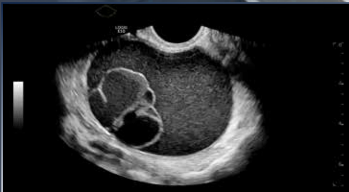
Cystic Ovarian Mass Visualized with Beta View, RIC5-9-D