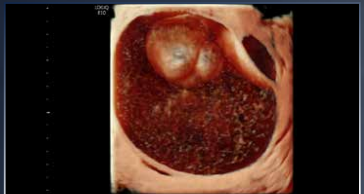
Ovarian Mass 3D Render with HDlive, RIC5-9-D