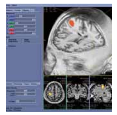
Figure 2. The BrainWave interface provides the capability to view fMRI results on 3D renderings or orthogonal slices. A simple motor task is presented in orange and yellow colors in the above screen.

Drs. Drevets and Bodurka anticipate their research and clinical efforts can change the way certain psychiatric diseases are diagnosed and managed.