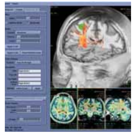
Figure 3. BrainWave also provides the flexibility to overlay Fractional Anisotropy maps on the orthogonal slides, create composite maps with multiple fMRI studies and the ability to combine those results with fibers tracked from DTI acquisitions.