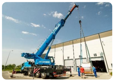
Installation & new OEM parts integration