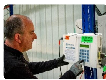
Magnet parameters and helium levels daily monitored and tested