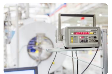
Rigorous magnet selection

Each system goes through an exacting, proprietary process to meet original system specifications and performance quality, using only OEM parts. GE HealthCare manages and owns this entire process relying on GE HealthCare authorized personnel performing to the latest GE HealthCare specifications.