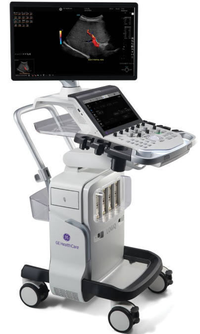
LOGIQ Totus™ Ultrasound