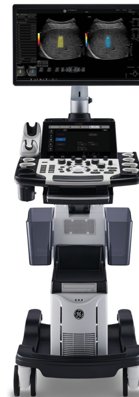
LOGIQ Fortis™ Ultrasound