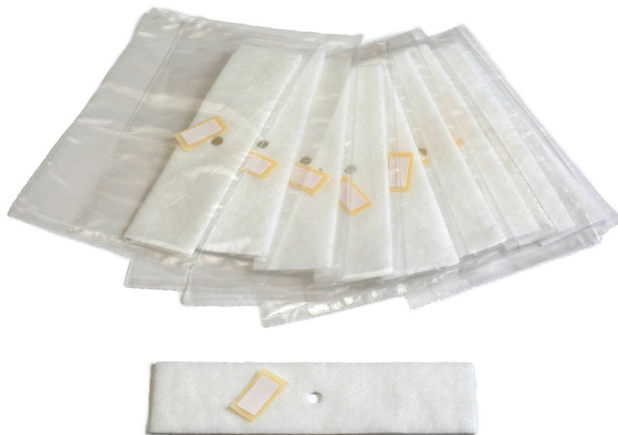
Air Filter, bi-directional

Our equipment. Our accessories. Simply compatible.